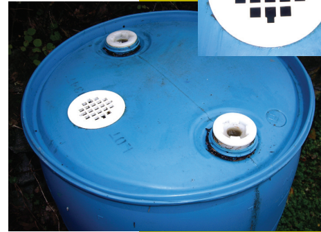
Lisa Meucci - 55 gal