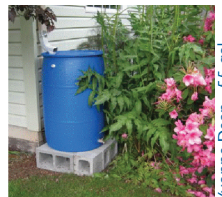
Yvonne Dean - 55 gal

Using a rain barrel to collect rainwater also helps reduce stormwater runoff that might otherwise run down storm drains and into our streams, rivers, lakes and bays. Stormwater runoff can cause flooding and erosion, and carry pollutants into our waterways.