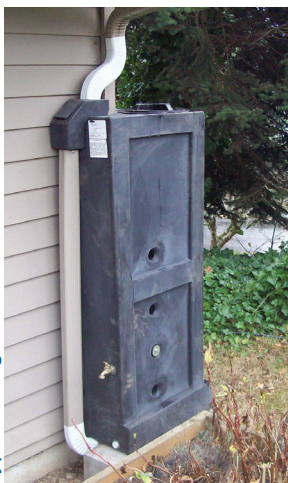
Cypress Designs - Anitra Accetturo

formation of ice which can damage your rain barrel. Avoid repeated freezing and thawing as this can weaken your barrel.