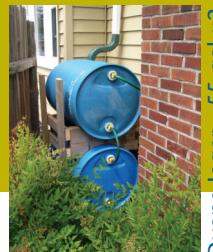
Duane Jager - 55 gal x2