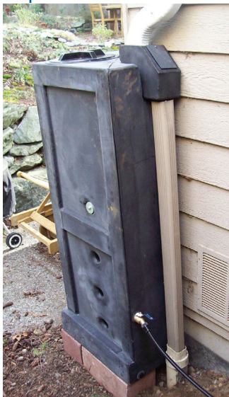
Cypress Designs - Anitra Accetturo