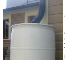
Todd Edison & Carrie Blackwood

There are a number of ways to connect the downspout to the rain barrel. Where you cut the downspout will depend on the type of connector material you choose. A flexible downspout extender makes an easy transition, eliminating the need for exact measurement because it bends and stretches. You can also use a downspout elbow, a section of straight downspout crimped on one end to fit into the hole, a rubber bib or coupling formed into a funnel shape or a chain that hangs from your gutter and drains directly into the rain barrel. Cut the downspout, then secure one connector