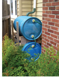
Duane Jager - 55 gal x2

Before installing rain barrels, take a moment to consider how the rain barrels will be used, how much water will be needed (especially during drier months), how many are being installed and how overflow will be handled. Also, make sure rain barrels are clean and free of debris before installing them. If the rain barrel(s) will be attached to a downspout, choose a convenient, easy-to-access location.