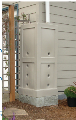
Cypress Designs - 95 gal

A rain barrel is a container that collects and stores rainwater – usually from rooftops and downspouts. Rain barrels