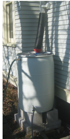
Todd Edison & Carrie Blackwood

Did you know a full 55-gallon rain barrel can weigh 450 lbs.!