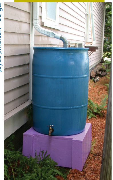
Joyce Jimerson - 55 gal