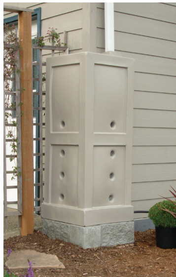
Cypress Designs - 95 gal