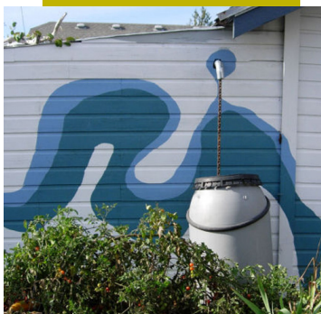
Colleen Burrows - 55 gal

For commercial rain barrel installation, follow manufacturer instructions.